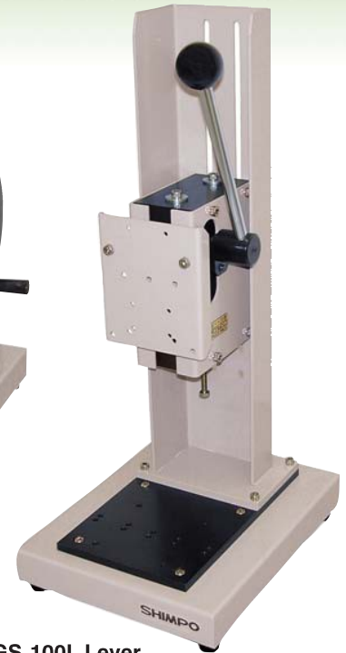
FGS-100L Lever Test Stand