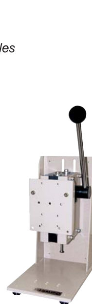
FGS-50S Lever Test Stand