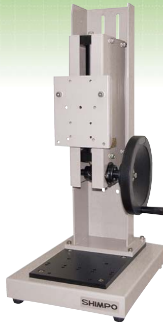
FGS-100H Hand Wheel Test Stand

Nearly all manufacturers' gauges are compatible with Shimpo's test stands for incredible versatility. These stands are designed for precision, balance, and durability. Therefore they are perfectly suited for measuring a limitless range of materials such as, wire, spring, plastic, paper cord, tubing, glass and composites.