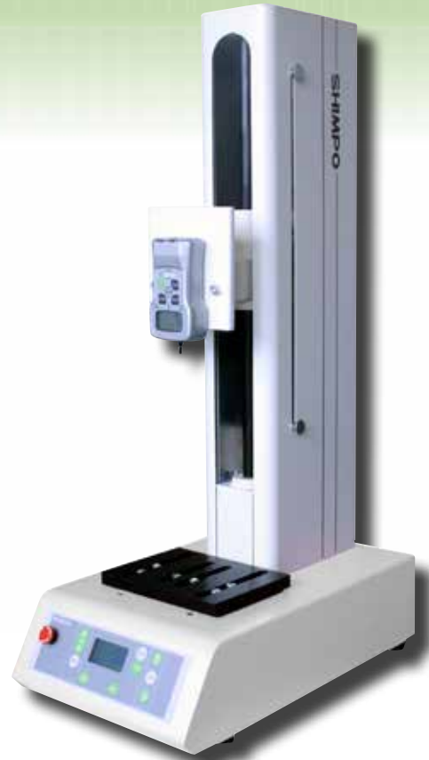
FGS-220VC Force Test Stand (Force Gauge Sold Separately)

The FGS-VC's can be equipped with various gripping and compression fixtures and are compatible with all Shimpo Digital Force Gauges. These features make the new FGS-VC the ideal push/pull tester for the production line or QC lab.