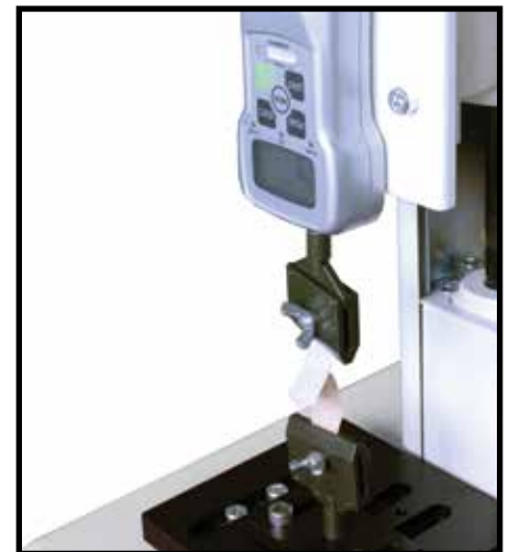
Stand with Optional Grip Performing Peel Test